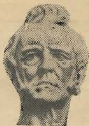
Commodore David Porter