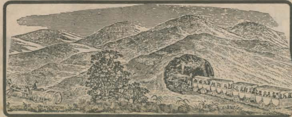
From The Western Citizen, July, 1844

A Porter County station was Crisman Station where Highway 20 and Crisman Road intersect. Continued on page 5