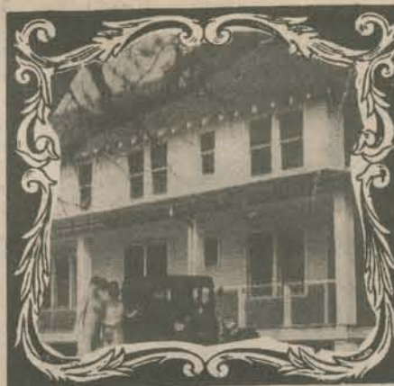
Lassen Hotel on the shores of Cedar Lake is now a museum with tours.

LOCATED ON THE SHORES OF CEDAR LAKE, INDIANA