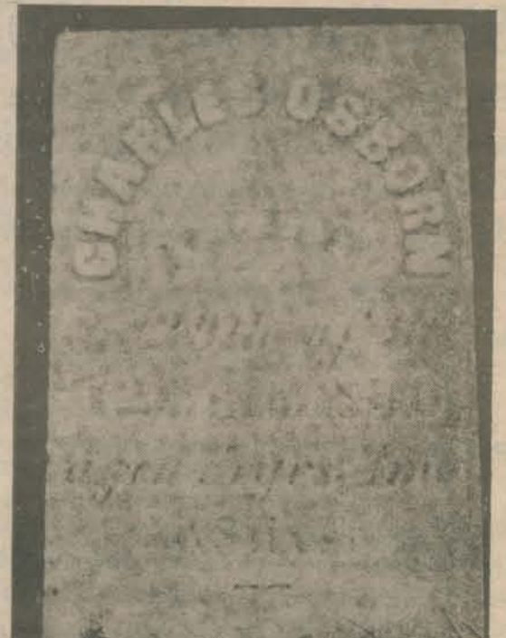
The gravestone of Charles Osborn is preserved at the Porter County Historical Museum, Valparaiso.

The Underground Railroad by Siebert, 1898, includes a listing by state of known agents. The