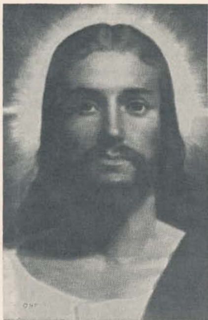
"HEAD OF CHRIST"