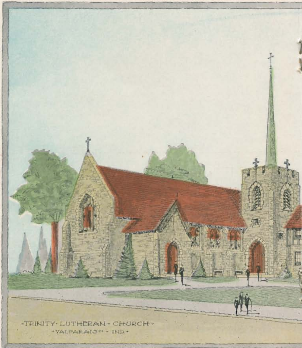
TRINITY LUTHERAN CHURCH AS IT

For the Praise and Honor of God and For the S