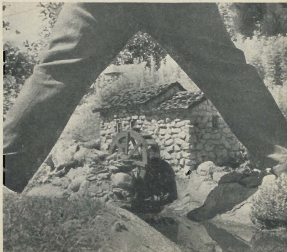
A modern Gulliver bestrides the old mill stream